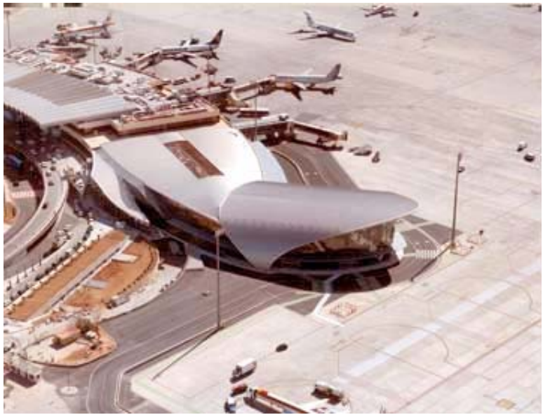
Regional aviation terminal